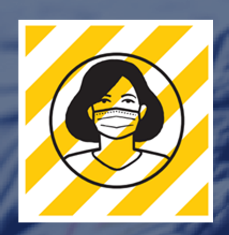
Wear a face covering