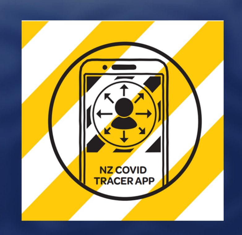
Scan or sign in

To keep everyone safe, the following requirements are to be observed.