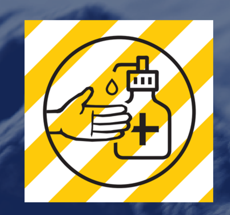
Sanitise on your way in